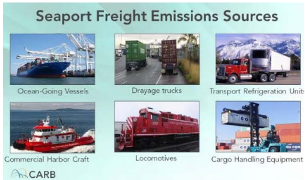
Figure 2: Seaport Freight Emissions Sources